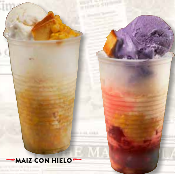
MAIZ CON HIELO

Soybean pudding served with tapioca pearls and syrup